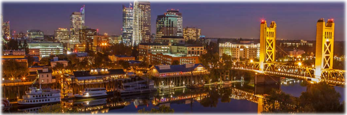
Downtown Sacramento (along the waterfront of Old Sacramento State Park)

The 2015 APCO Western Regional Conference is being hosted by the Northern California Chapter of APCO International. It has been well over a decade since the APCO WRC has been hosted in the Northern portion of the Golden State. This Conference is sure to attract members from the entire Country; especially those in the Western Region. With the next two APCO International Conferences both being held East of the Mississippi in Washington DC 2015, and Orlando 2016, and the 2014 Conference in New Orleans, this Conference will provide the best opportunity to connect with public safety communications professionals close to home.