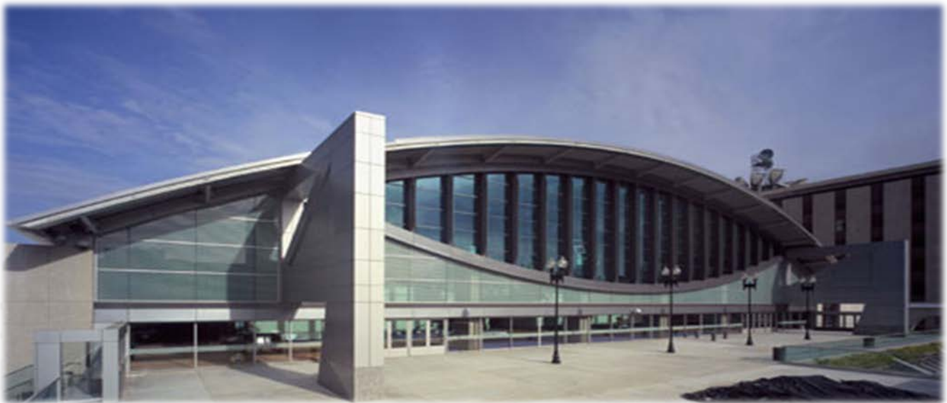
Conference Venue: Sacramento Convention Center

The 2015 APCO Western Regional Conference is being hosted by the Northern California Chapter of APCO International. It has been well over a decade since the APCO WRC has been hosted in the Northern portion of the Golden State. This Conference is sure to attract members from the entire Country; especially those in the Western Region. With the next two APCO International Conferences both being held East of the Mississippi in Washington DC 2015, and Orlando 2016, and the 2014 Conference in New Orleans, this Conference will provide the best opportunity to connect with public safety communications professionals close to home.